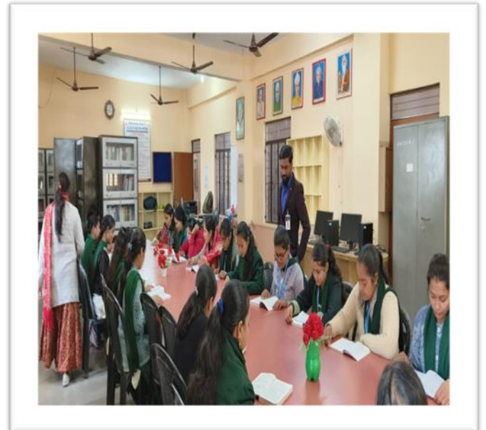
Mentor are Mentoring Student during Reading in Library