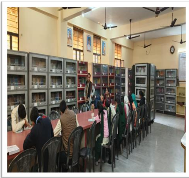
Student are Reading in Library

We believe that the College library is the gateway to knowledge, provides a basic condition for lifelong learning, independent decision-making, and academic development of the students and the faculty. Focusing upon this very important role, our college Library has been growing steadily over the years.