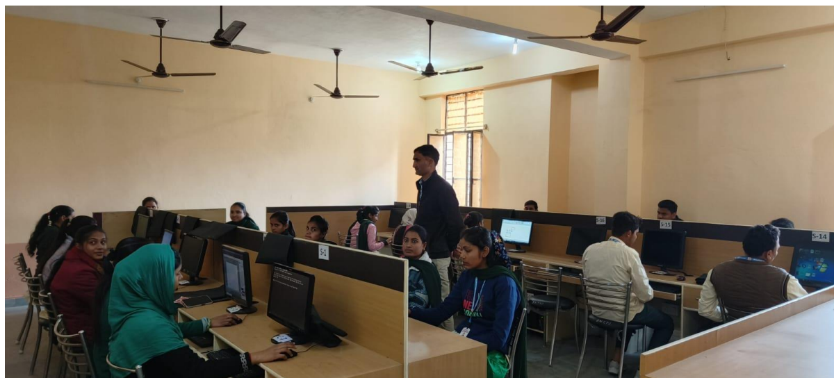
Mentor mentoring to Students how to use Computer

As the lab facilities are concerned, our college is having a sophisticated computer lab with all the facilities. We have as many computers as the students needed. There is a separate lab facility for B.Ed. students. The computers are having all the software needed for the study purpose. It helps the students to get the idea of software development and to get familiar with various programming languages.