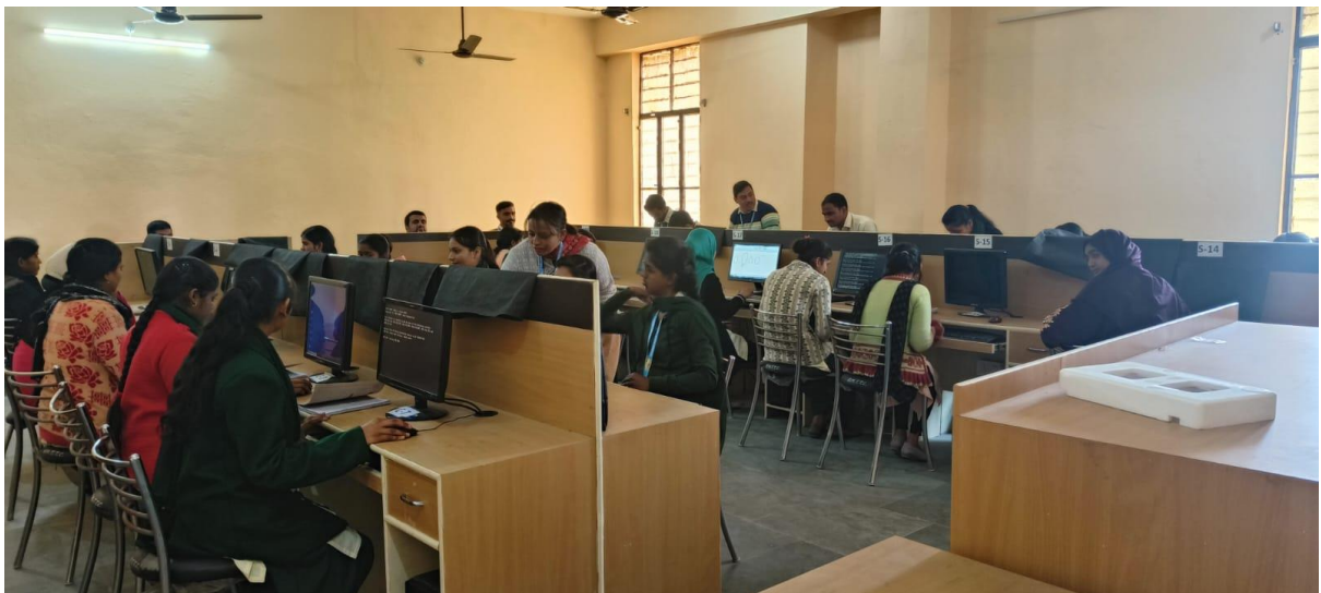
Mentor Looking on Students by use computers in computer lab

Computers with internet connection are available both for students and teachers in the library, staff room and computer labs. The college library and the computer laboratories have access to advance web activity with its subscription to E-resources through DU Network that links students and faculty researchers to the databases needed for research. The machines and programmes are continuously upgraded to ensure the market relevance of acquired skills.