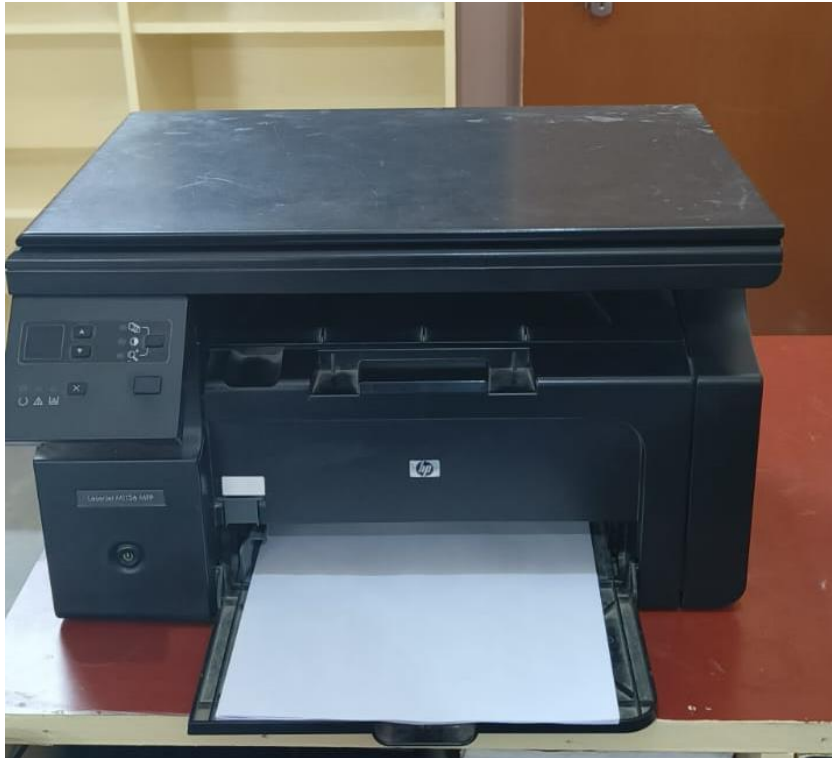
Photocopier machine in Library for Students use

The college has a very good collection of books including textbooks, reference books, periodicals, and journals. The total number of books at present is 10,000 and the college subscribes to 20 journals and newspapers. The library is open from 9.30 a.m. to 4.30 p.m. on all working days. The different subject sections are well-displayed, and every student is encouraged to make the best use of the library and reading room. The library is equipped with internet facility. The library has an internet leased line with the speed of 10 MBPS. Cleanliness and maintenance of the library is always given top priority.