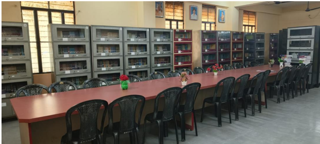
Reading Room in Library